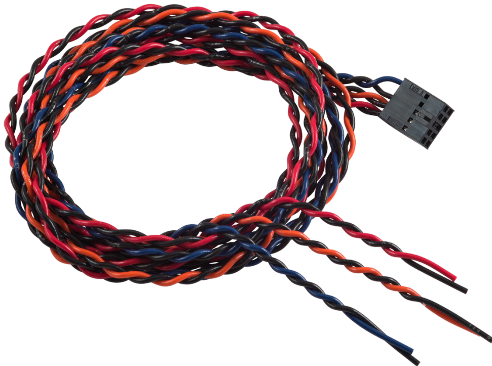
Control Cable Assembly (PCA-9190)

An optional micro-stripline Output Cable allows the user to connect the PCO-7115 to a remote laser diode with minimum added inductance.