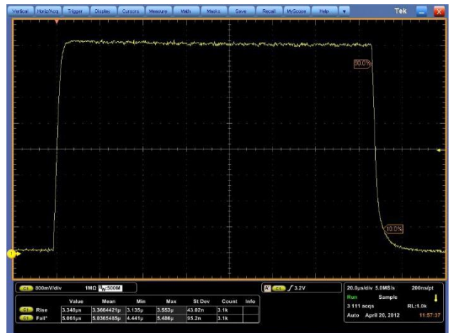
PCM-7510, 50 A, 150 \mu s pulsewidth