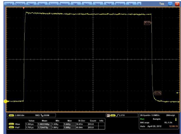
PCM-7510, 250 A, 150 \mu s pulsewidth